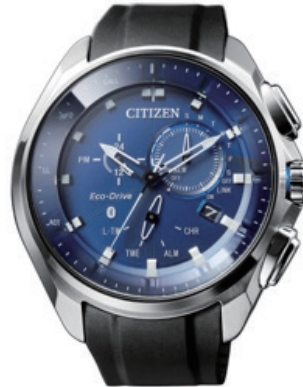
“CITIZEN Bluetooth Watch” BZ1020-14L Summer 2017

At Baselworld 2017, CITIZEN will announce the new Bluetooth Watch model.